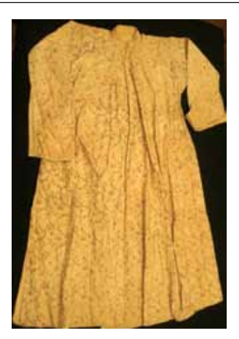
სურ.1. ერეკლე II-ის ხალათი Fig. 1. King Erekle II's robe