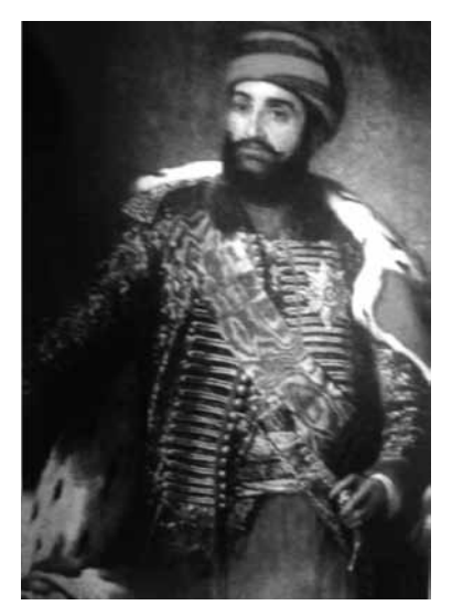
სურ. 6. ერეკლე II Fig. 6. King Erekle II