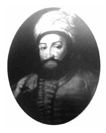
სურ. 7. თეიმურაზ II Fig. 7. King Teimuraz II