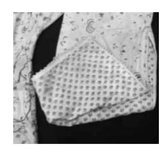
სურ. 2. ერეკლე II-ს ხალათის სახელო Fig. 2. A sleeve of Erekle II's robe