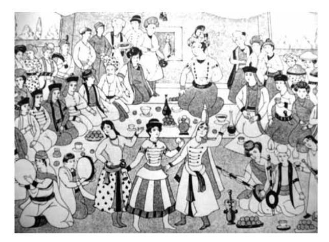
სურ.16. ირანული მინიატურა Fig.16. Iranian miniature