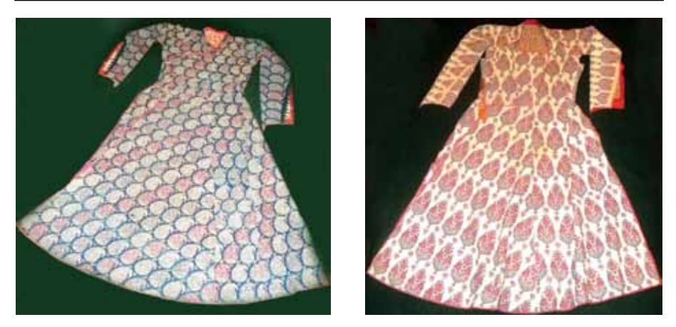
სურ.11,12. ალექსანდრე ბატონიშვილის ახალუხები Fig. 11, 12. Prince Alexander's "Akhalukhs"