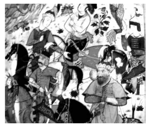
სურ.3. სპარსული მინიატურა Fig. 3. A Persian miniature