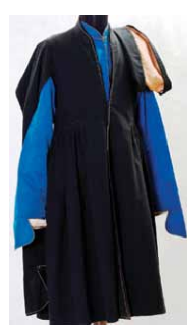
სურ.13. კაბა-ახალუხი Fig. 13. Men's dress with akhalukhi