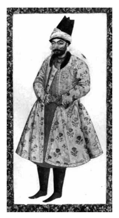
სურ. 10. ნადირ-შაჰის პორტრეტი (ჟენევის ხელოვნებისა და ისტორიის მუზეუმი) Fig. 10. The portrait of Nadir Shah (Geneva Museum of Art and History)