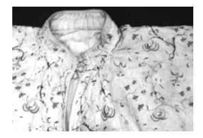
სურ.4. ერეკლე II-ის ხალათის ფრაგმენტი Fig. 4. An element of King Erekle II's robe