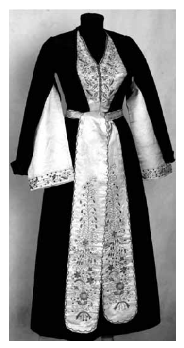
სურ. 17. ქართული კაბა (XIXს.) Fig. 17. Georgian women's dress

სურათები 1, 2, 4, 5, 6, 7, 8, 11, 12, 13, 14, 15, 17 © დაცულია საქართველოს ეროვნულ მუზეუმში