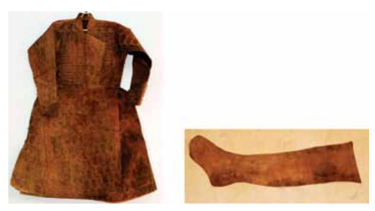
სურ.8. თეიმურაზ II-ის სამეფო კაბა და მაღალყელიანი წინდა Fig. 8. King Teimuraz II's royal dress and silk sock