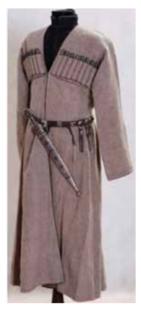
სურ. 14. ჩოხა-ახალუხი Fig. 14. Chokha-akhalukhi