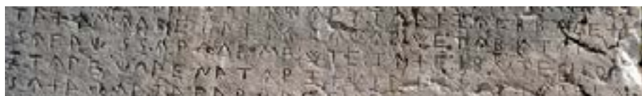
Image 4: Photo, kindly sent by Diether Schürr, of TL44a.48-50 as they looked in 2020.

Image 2 is included here because a version of this inadequate representation could be used by some people as a primary source and so could be misleading. For instance, we can see that the right-hand end of the middle line has missed one upright stroke from C||, and the lambda-like penultimate letter has vanished, while the letter '+', seventh from the end of the bottom line, has been omitted, but the vertical stoichedon alignment has been kept active, thus moving the final six letters one column to the left.